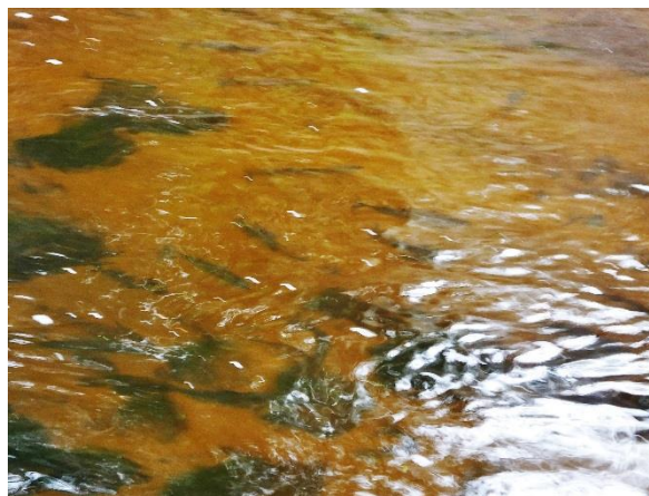
Blueback herring spawning in the Salmon River, Leesville.