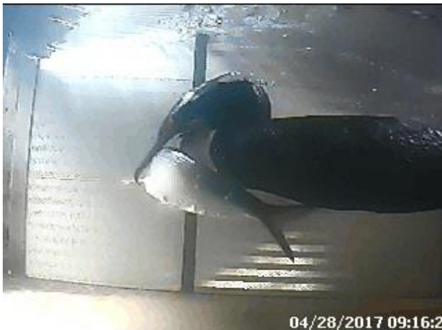
Last week we showed a photo of a school of alewives swimming past the Bunnells Fishway camera. This week we show the resident cormorant, which seems to appreciate the fishway..

My weekly Diadromous Fish Radio show is live on iCRV ( www.iCRVradio.com ) at 8:00 am on Wednesday and re-played at 3:00 and 7:00 pm that day 8 am on Saturday. iCRV now archives shows so if you miss one, you can go online and click on "Outdoors" and the "Fishing" and find past shows to listen to.